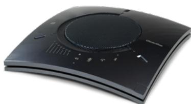
CHAT 150 Unit