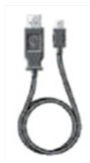
USB 2.0 Connection Cable